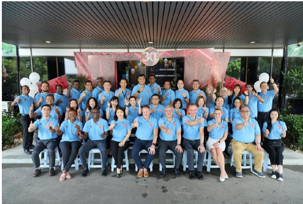
In a statement, Atech said this marked its foray into the new automotive industry sector.